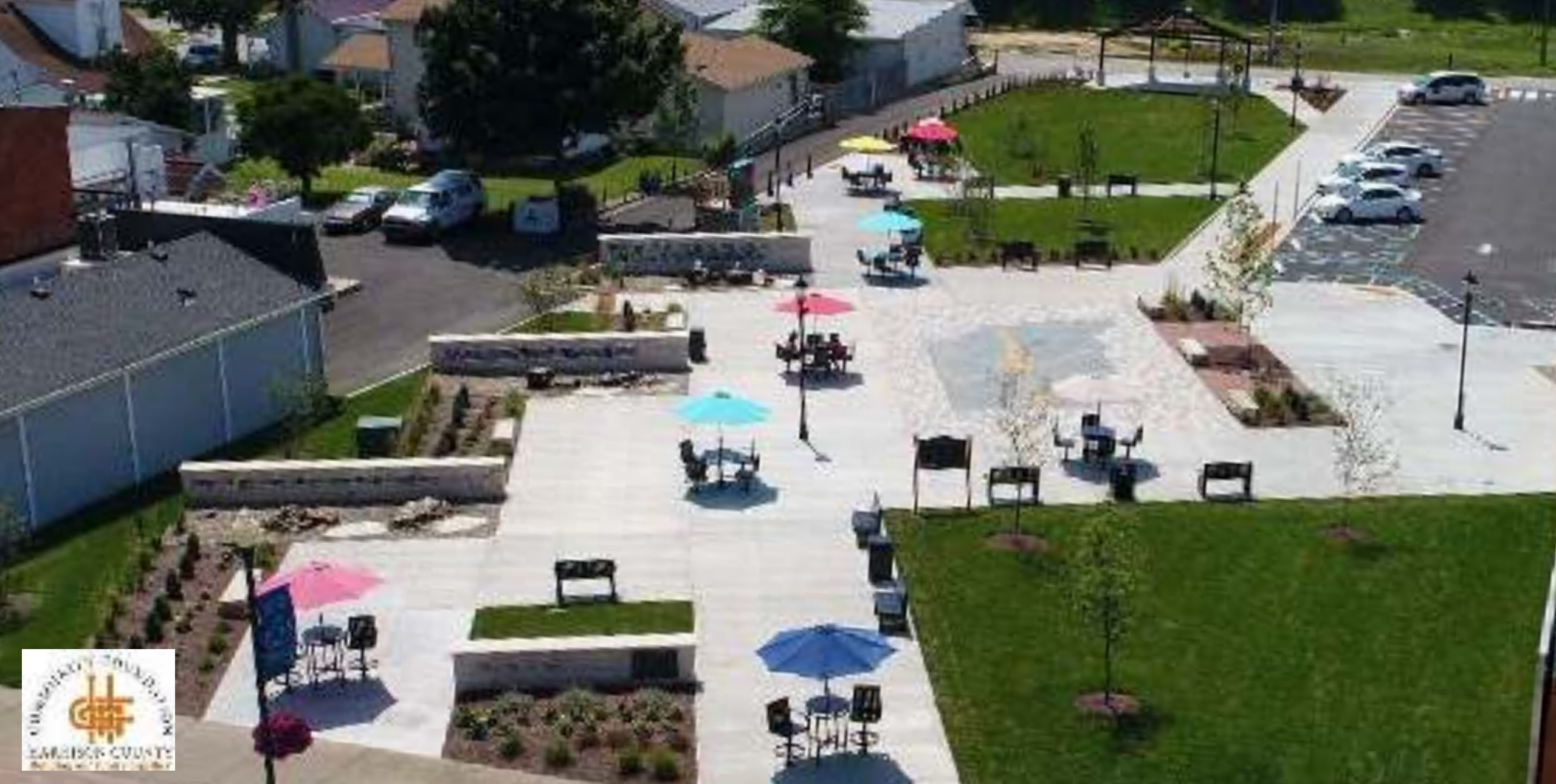
OUR STELLAR FOUNDATION: Bicentennial Park