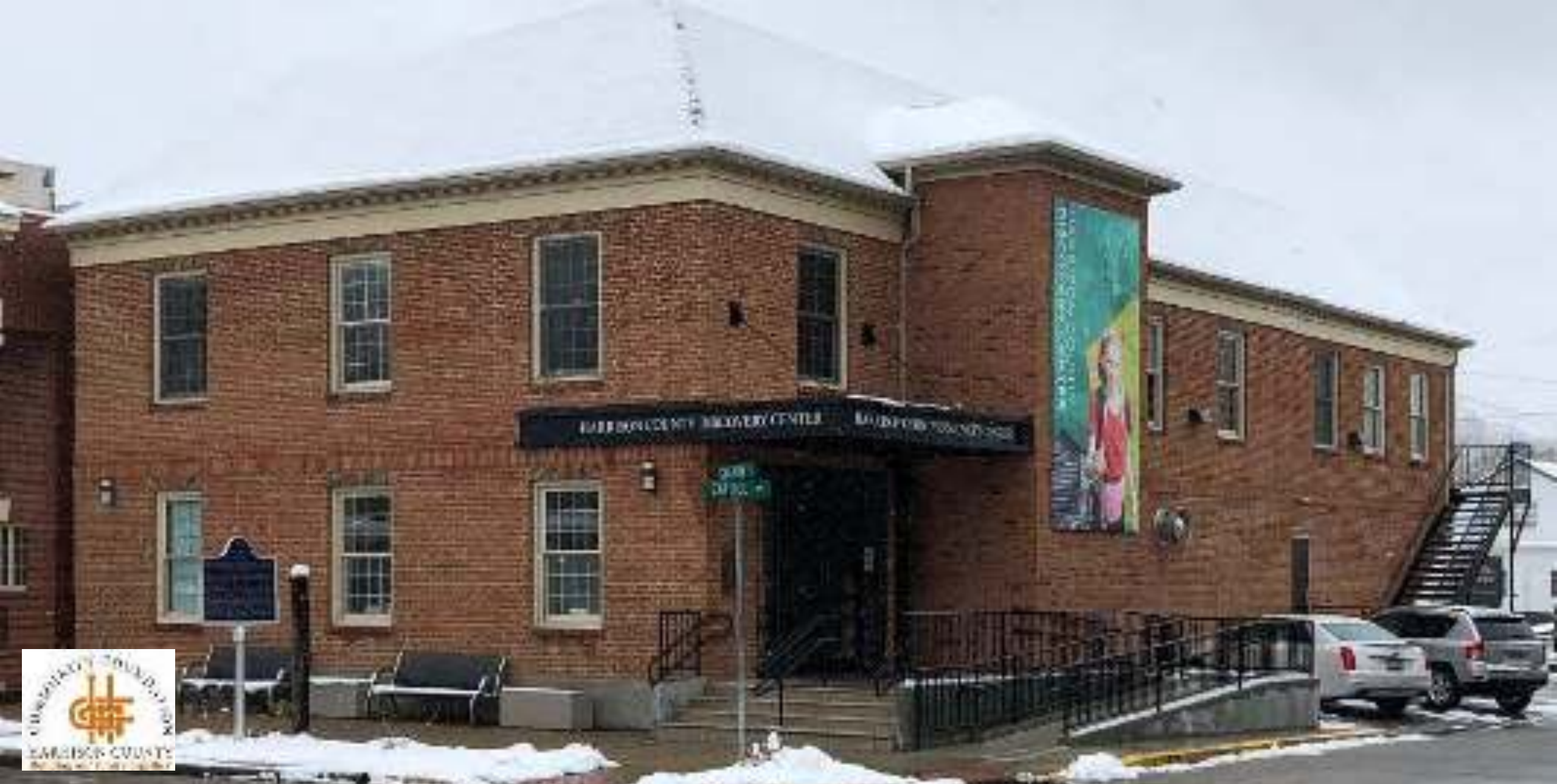
OUR STELLAR FOUNDATION: Discovery Center